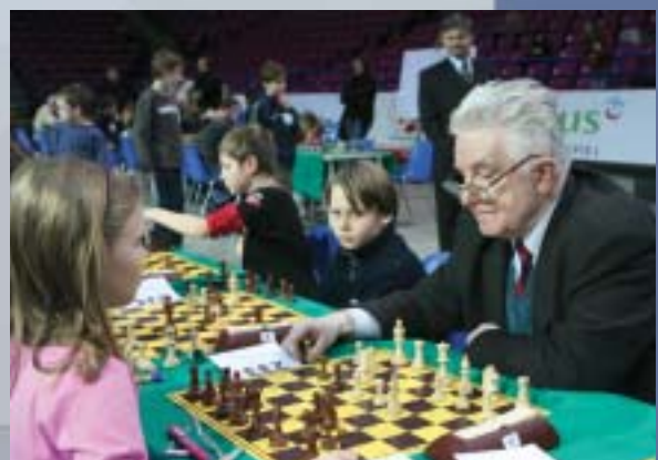
Chess is a sport without age bars.