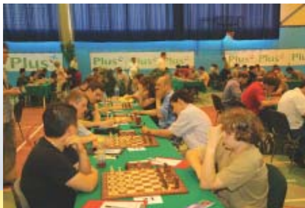
Miguel Najdorf Mazovian Chess Festival, Grodzisk Mazowiecki 2007