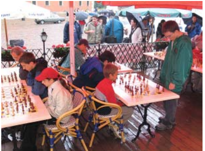
GM Mateusz Bartel simul, Castle Square, Warsaw 2004