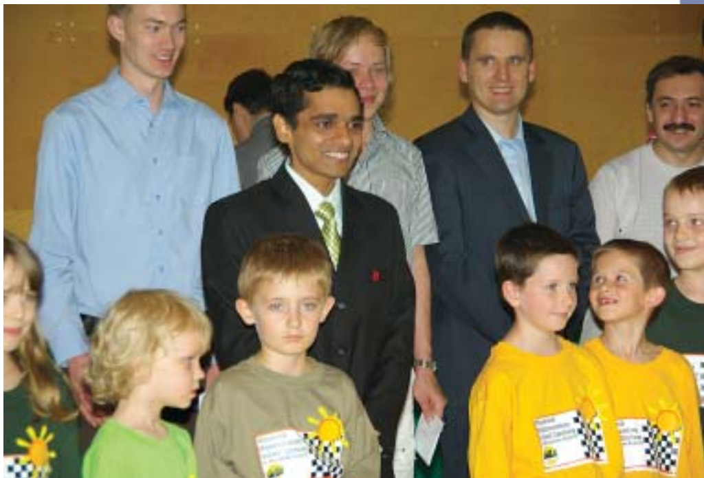
Outstanding Grandmasters with the youngest participants of the Miguel Najdorf Mazovian Chess Festival, Warsaw 2008