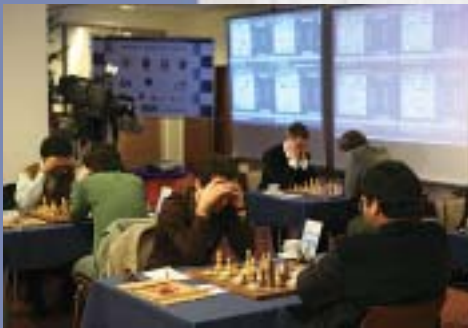
The playing hall in Novotel.