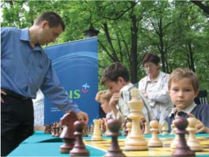
GM Bartosz Soćko simul, Saski Garden, Warsaw 2006.