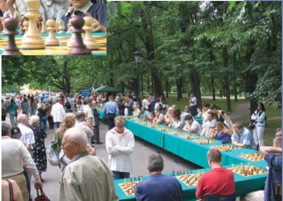
Simul to mark the 86 th anniversary of the Warsaw Battle 1920, Saski Garden, Warsaw 2006.