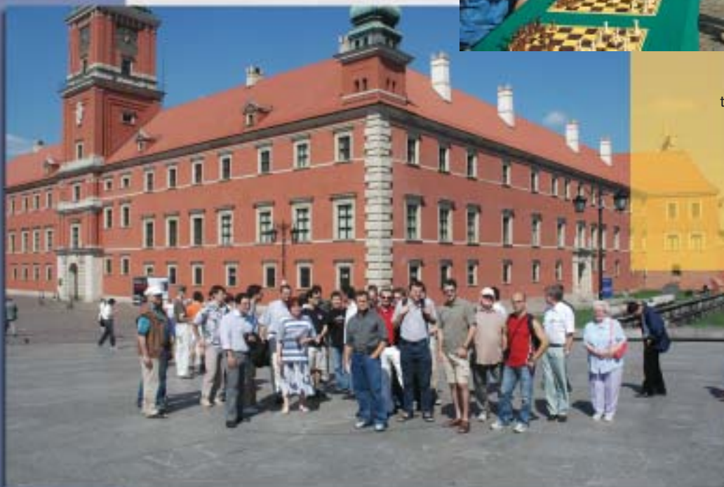
Participants of the 2005 European Championship on a sightseeing tour in Warsaw.