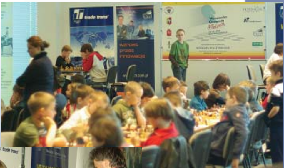
Warsaw Youth Olympiad, Olympic Centre, Warsaw 2008.