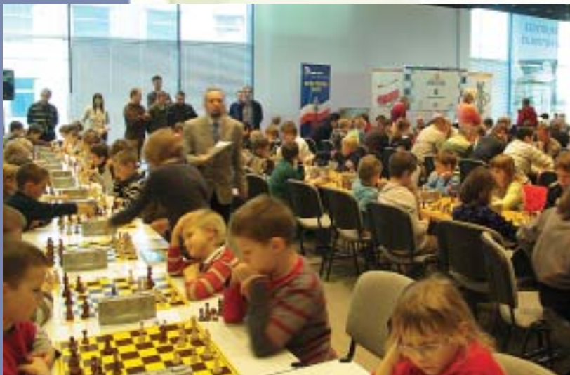
PKO BP Grand Prix, Olympic Centre, Warsaw 2008.