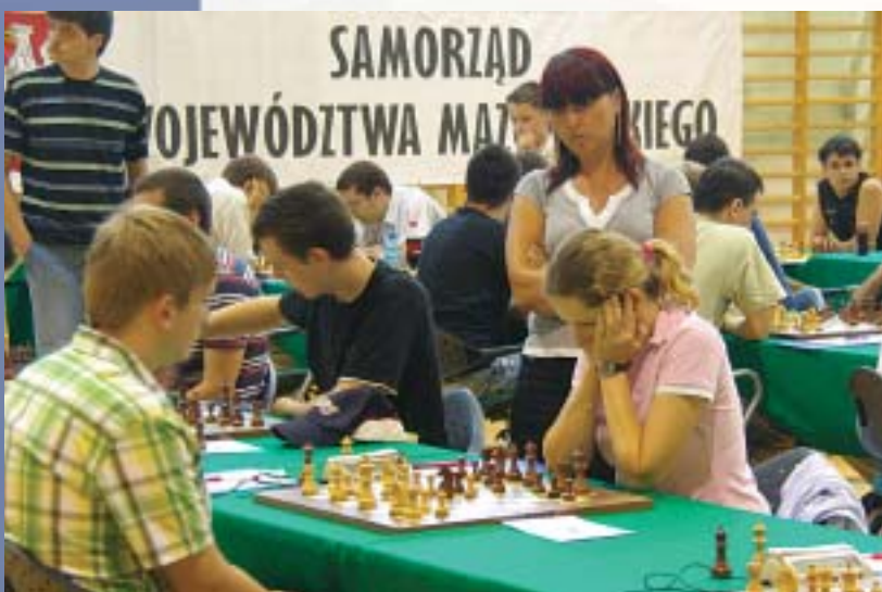
Mazovian Chess Festival, OSIR Polna, Warsaw 2008.