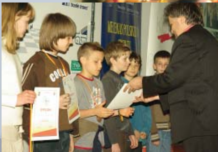
The youngest prize-winners of the Warsaw Youth Olympiad.